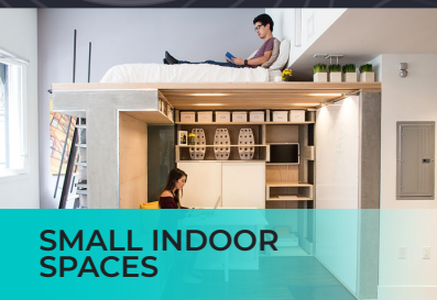
SMALL INDOOR SPACES